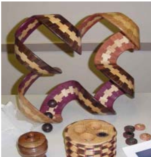
Malcolm Tibbetts - Checkers and Holder in foreground (to match chess table shown at State Fair). Large Roundabout made from six indentially sized bowls.