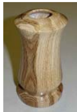
Mark Stanley - Walnut Box