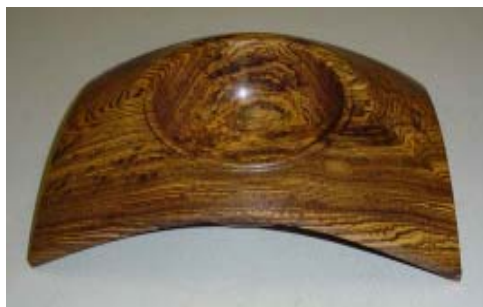
Warren Nadler - Bocote Bowl