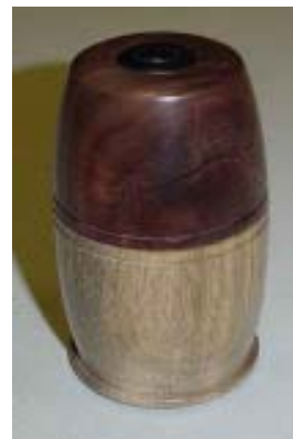
Kirk Stubbs - Threaded Box