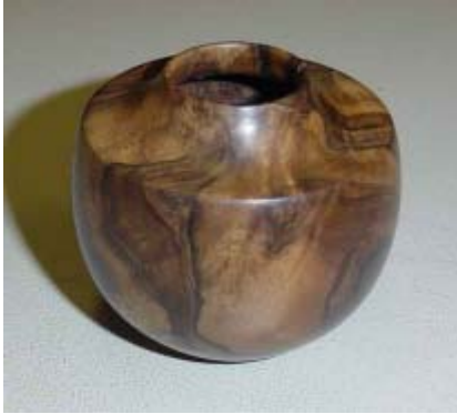
Mets Lerwill - Miniture Walnut Vessel