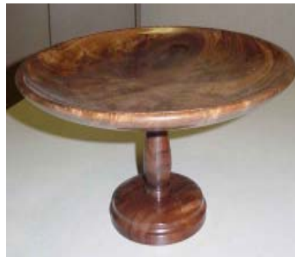
Herb Medsger - Compote with Wire Inlay