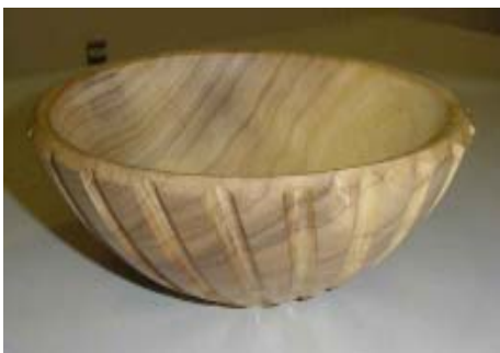
Tom Castalda - Fluted Myrtle Bowl