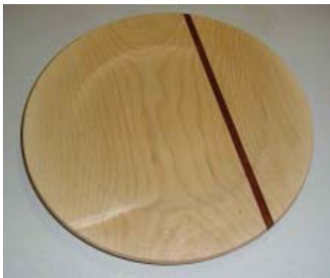
Ron Winterton - Maple/Mahogany Plate