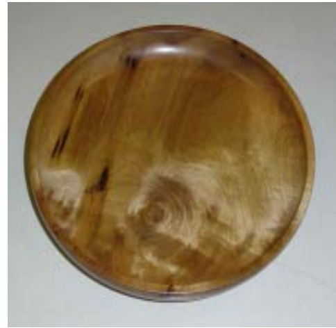
Warren Nadler - Myrtle Platter