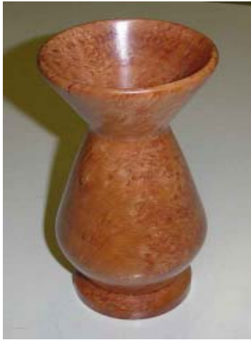
Phil Sargent - Sycamore Vase