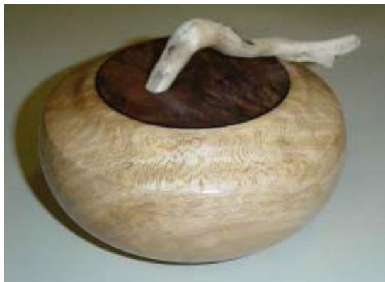
Herb Medsger - Spalted Sycamore Lidded Box