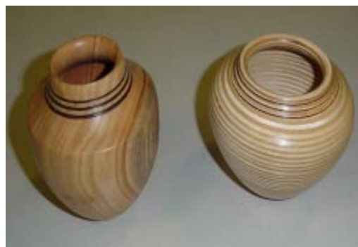
Mets Lerwill - Sycamore Vessel and Baltic Birch Plywood Vessel