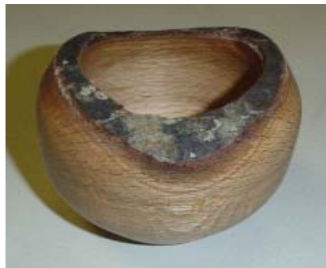
Mark Cullars - Natural Edge Oak Bowl