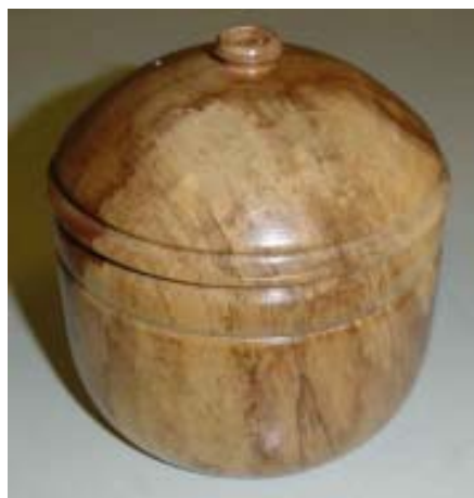
Kent Nelson - Lidded Contrainer