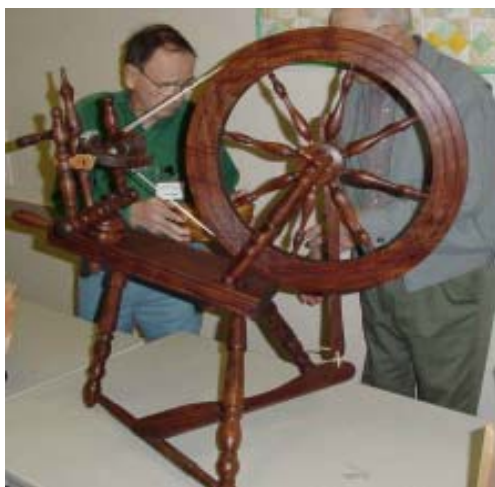
Bill Flewelling - Spinning Wheel