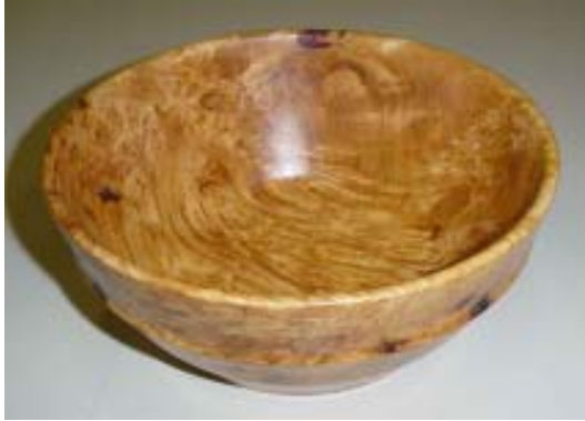
Warren Nadler - Maple Burl Bowl