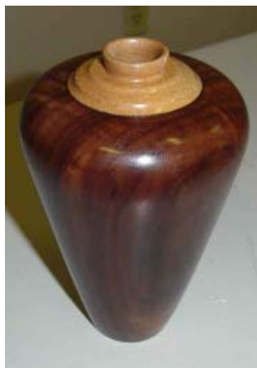
Phil Sargent - Walnut and Maple Vase