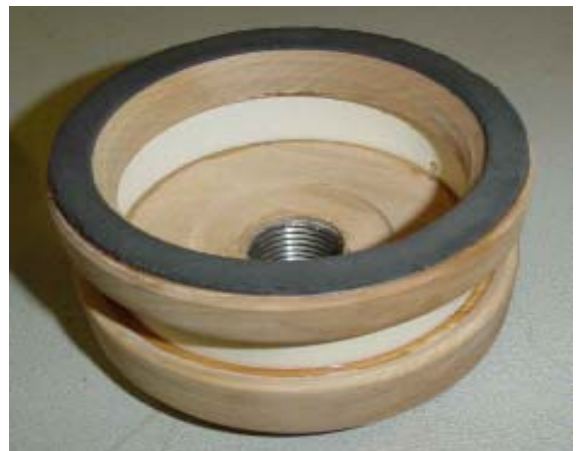
Will Michaud - Vacuum Chuck