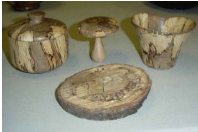
Kenn Womack - Small Spalted Oak Box, Mushroom, Vase and Scrap