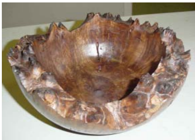
Glenn Robison - Natural Edge Walnut Bowl