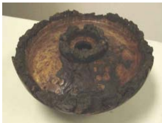
Glenn Robison - Walnut Burl Closed Bowl