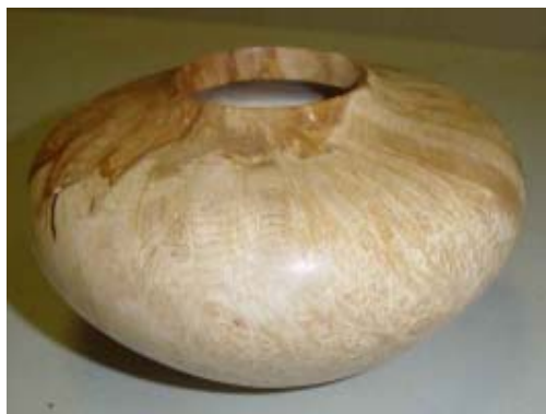
Vince Cleek - Maple Burl Bowl