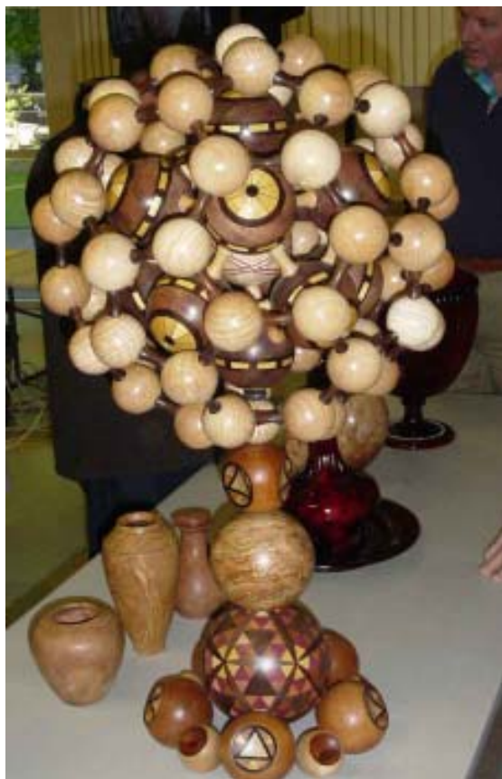
Malcolm Tibbetts - "Pearls of the Forrest"