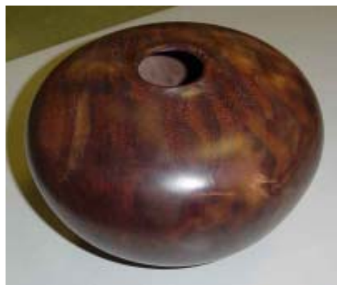
Kirk Stubbs - Walnut Closed Vessel