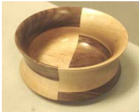
Sidney Moore - Walnut & Maple Bowl