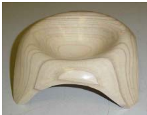
Dale Blue - Magnolia Square Bowl