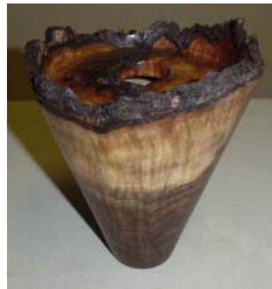
Glenn Robison - Natural Edge Walnut Vessel