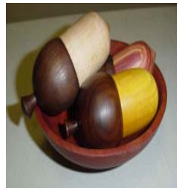
Ron Winterton - Threaded Nuts in Bowl