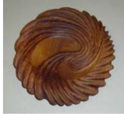
Rollie Bowns - Carved Madrone Platter