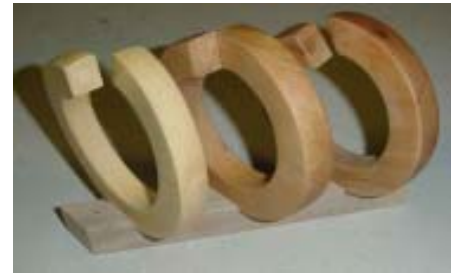
Charles Brownold - Lock Washers