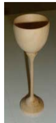
Sonja Lemon - Birch Goblet