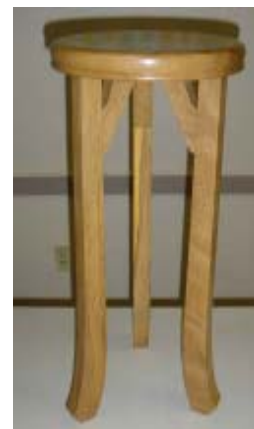
Rollie Bowns - White Oak Stool