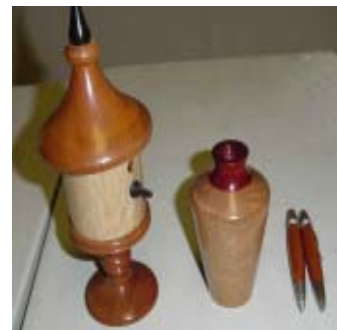
Tyler Hosea-Small - Birdhouse, Vessel and Pen & Pencil