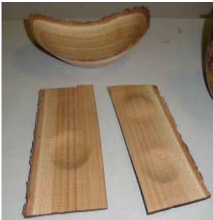
Bill Flewelling - Natural Edge Bowl and 'Things'