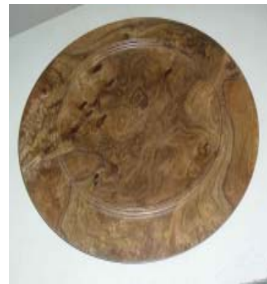
Tom Castaldo - Very Large Redwood Platter