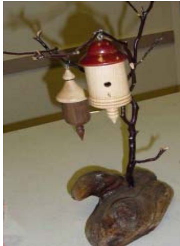
Camden Hosea-Small - Bird House Ornaments