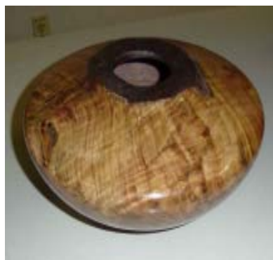
Herb Medsger - Bleached Walnut Vessel