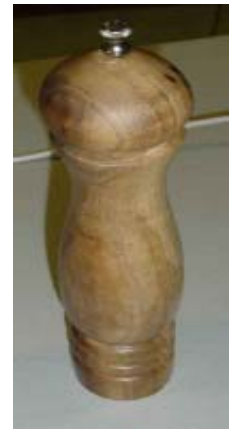
Curtis Tarpley - Peppermill