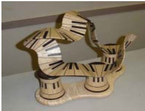
Malcolm Tibbitts - Magical Mobius