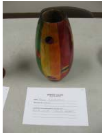
Bruce Friederich's Prism colored vase "Rainbows"