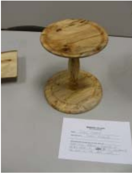
Dan Clark's plant stand