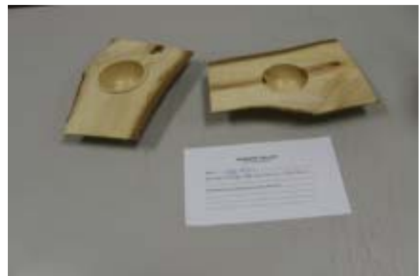
Dale's square bowls