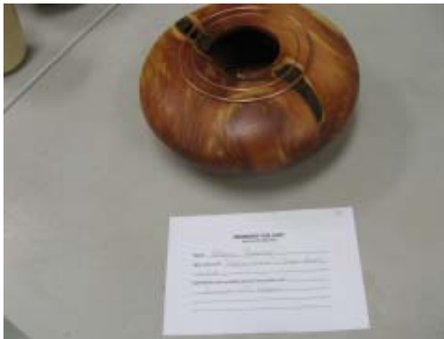
Glenn Robison's semi-closed vessel of Juniper with copper trim "Copernicus"