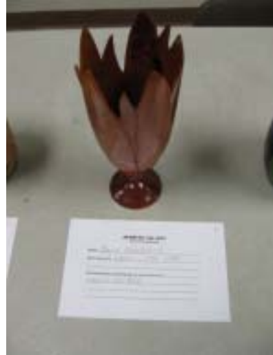
Bruce Friederich's Pink Ivory vase "Mypod"