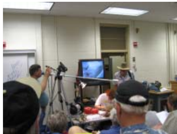
Tying up the loose ends of the Celtic knot.