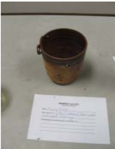
Katy Globus' Walnut/Basswood bowl