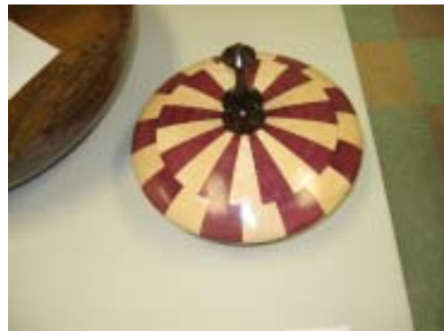
Ron Coney's segmented lidded vessel