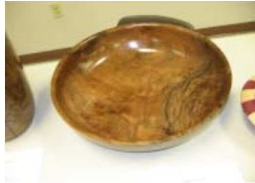
Bruce Friederich's Bastogne Walnut bowl