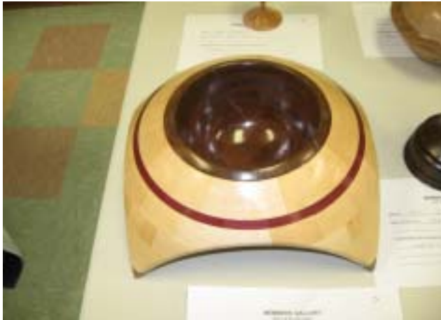
Ron Coney's segmented square footed dish