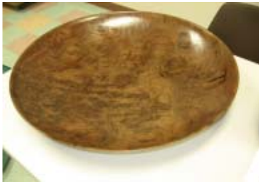
Bruce Friederich's Walnut burl platter