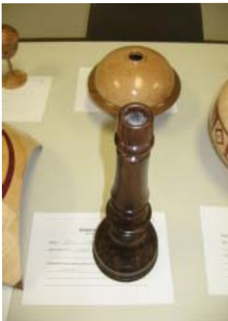
Phil Sargent's Walnut candle-stick