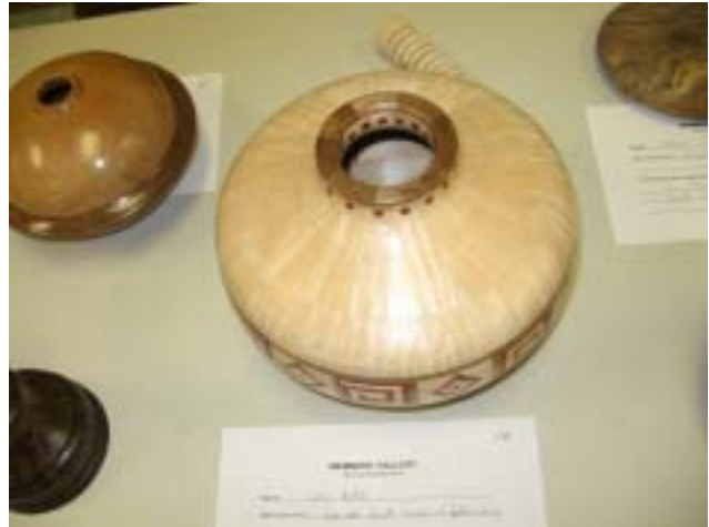
Bob Adam's segmented closed vessel with a feature ring