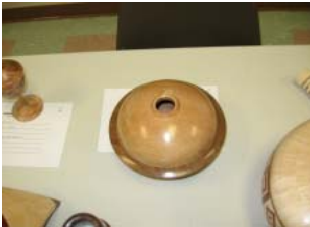
Kenn Womack's hollow vessel of Black Walnut and Maple