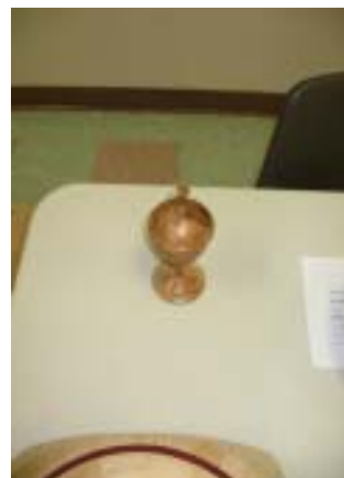
Kenn Womack's Maple burl spice jar