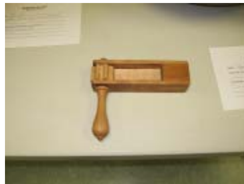
Rollie Bowns' crow chaser (loud!!)