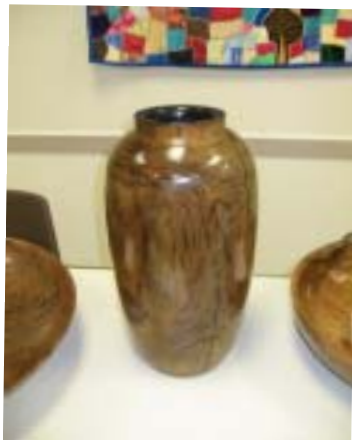
Bruce Friederich's English Walnut urn for a dinosaur