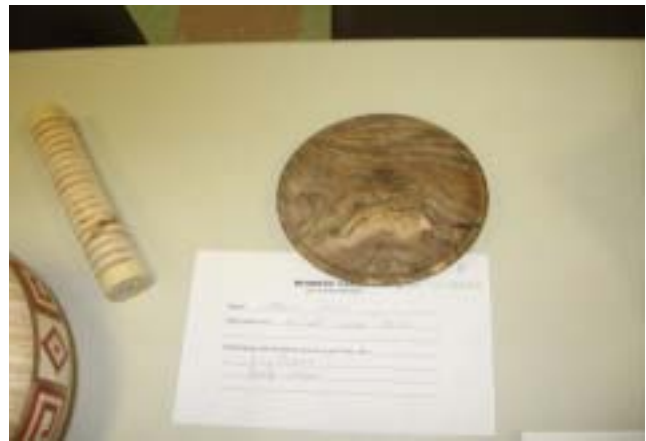
Corwin Jones' Walnut cheese dish (in progress)