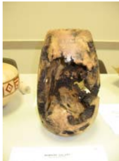
Bill Flewelling's Black Oak vase