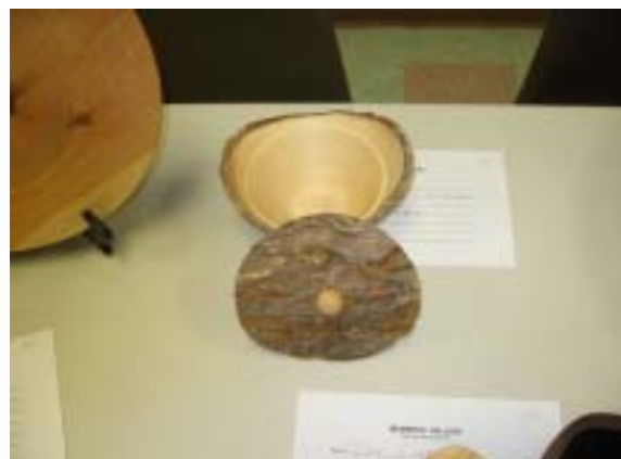
Glenn Robison's natural edged - and natural lidded - lidded vessel of Silver Maple