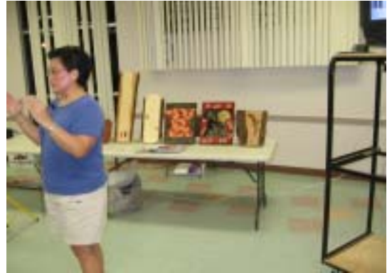
Some of her very exquisite chip (a term she does not prefer) carvings.