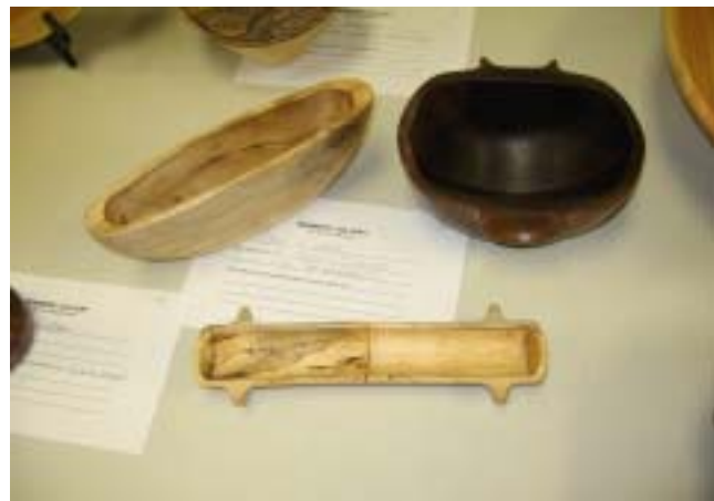
Dan Clark turned three items, cut each in two, then re-assembled them. Interesting. (I usually mark the parts when I dis-assemble things so I'll know how the parts go together... Editor)