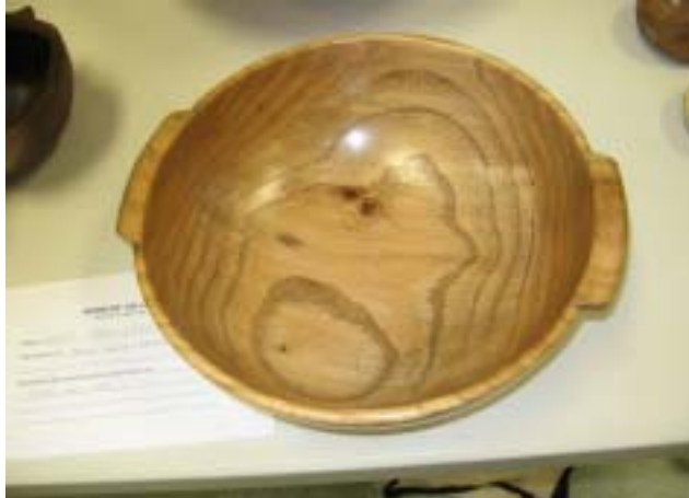
Herb Medsger's tinted Red Oak bowl with handles