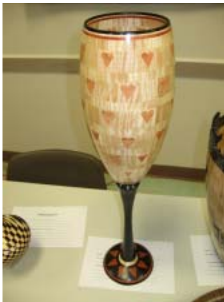
"Elixir" (Author unknown)