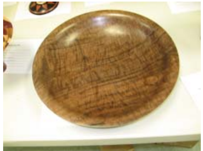
Norm Hinman's Walnut bowl