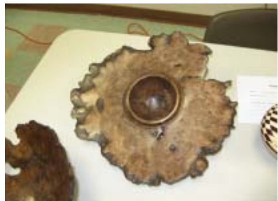
Phil Sargent's starburst Walnut bowl