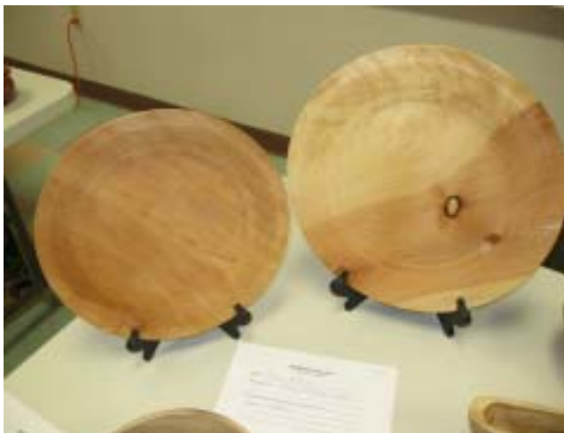
A plate and a platter of Pear wood by Dale Blue