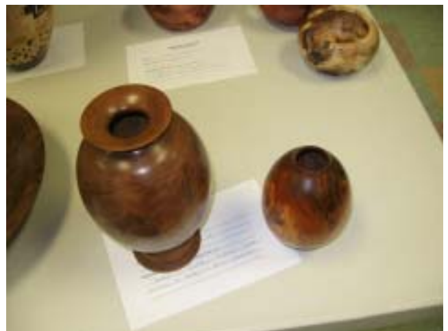
Herb Medsger's two vessels. One of Peach and one of Plum.