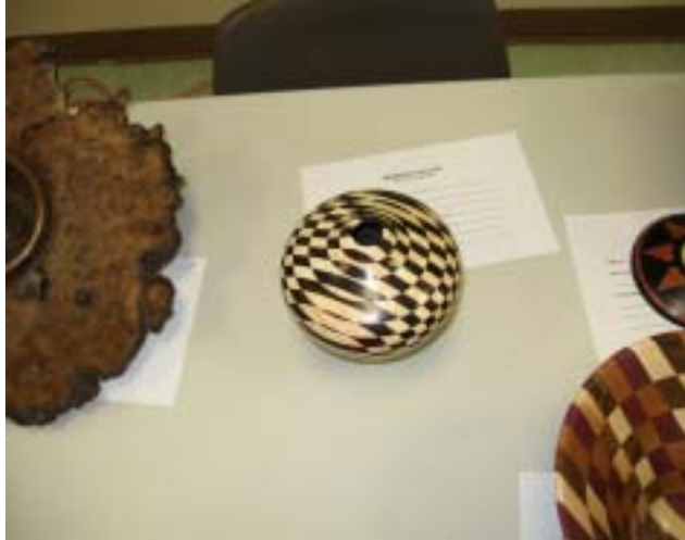
Checkeded Vessel of Rosewood and Birdseye Maple. (Author anonymous)