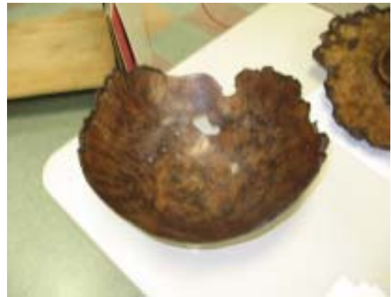
Phil Sargent's 'very' natural-edged Walnut burl bowl