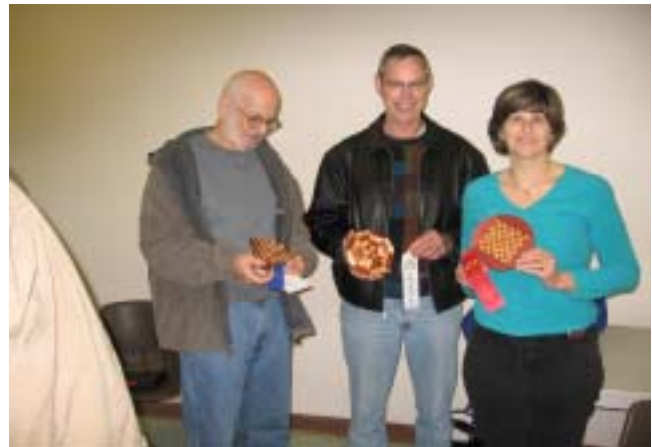
First, Second and Third place winners Novice