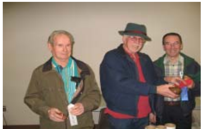
First, Second and Third place winners Advanced