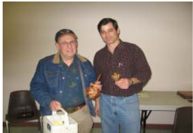
First and Third place winners Intermediate (Not pictured: Second place winner Dale Blue)