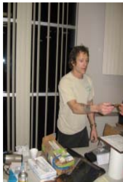
Asking for a second opinion