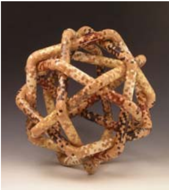
“Neighbors”, by Malcolm Tibbetts.

Pre-registration is $30 for Nor-Cal members. Registration for non-members, and members at-the-door is $45.