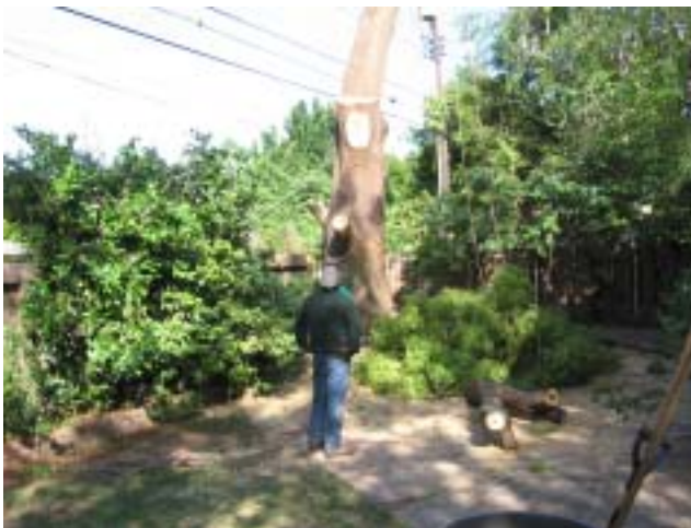
Same Camphor tree... slightly different view.