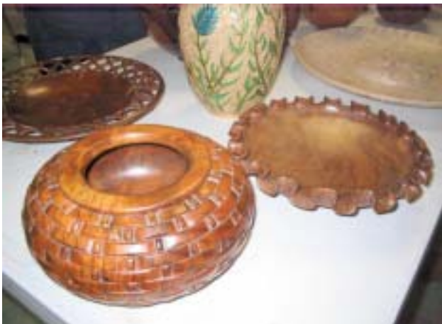
Bruce's basket weave vessel