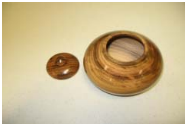
Herb Medsger's Black Locust lidded vessel