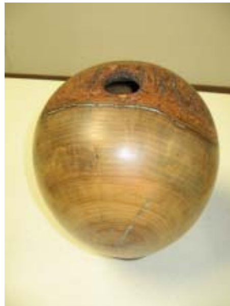
Ted Young's Camphor hollow vessel