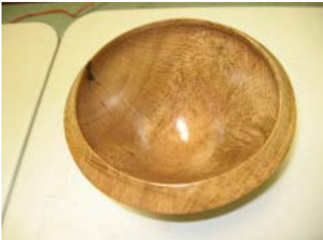
Phil Sargent's Blue Oak bowl