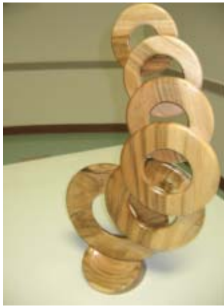
Dan Clark's "Rising Sun" of English Walnut