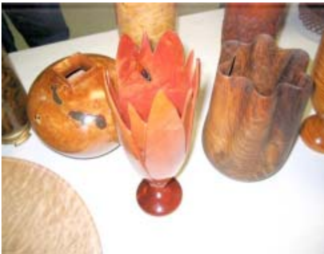
A sampling of Bruce's carving repertoire