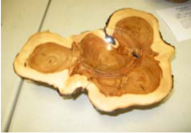
Phil Sargent's Leland Cypress winged bowl