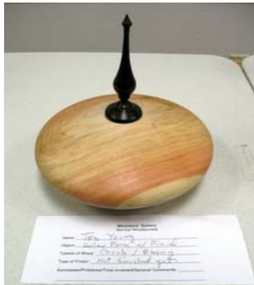
TTed Young's Carob/Ebony hollow form with finial