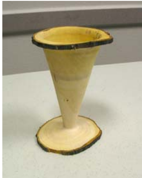
Glenn Robison's Plum rootstock vase