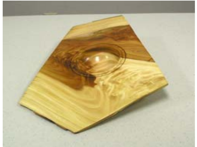
Phil Sargent's Chinese Elm wing bowl