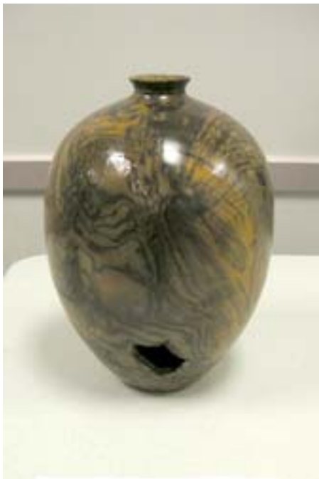
Barry Hanna's Black Walnut vase