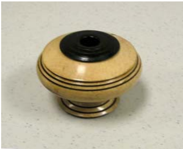
Phil Sargent's African Sumac vase with Ebony collar.