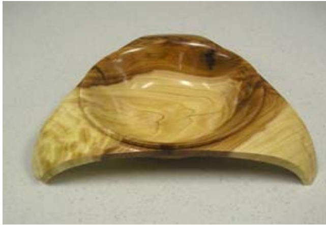
Phil Sargent's tripod suspended Chinese Elm bowl