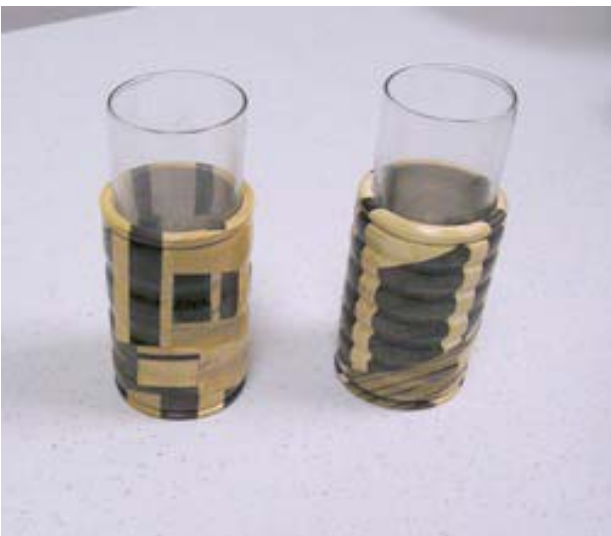
Ron Coney's glasses w/ segmented bases