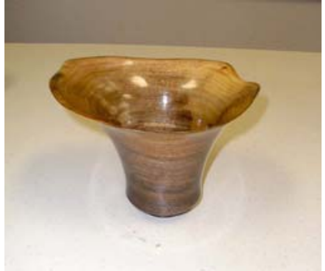
Jose Pantoja (Seattle Chapter - AAW) Natural edged vase