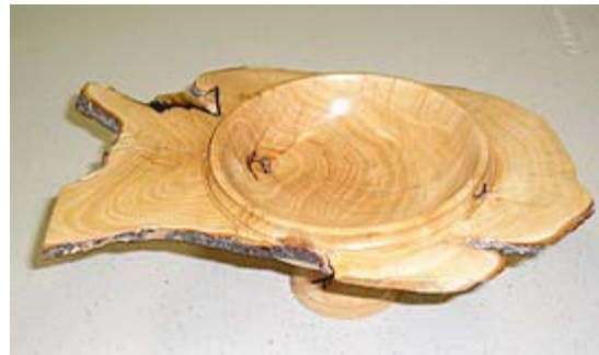
Phil Sargent's Lelandi Cypress Einged bowl