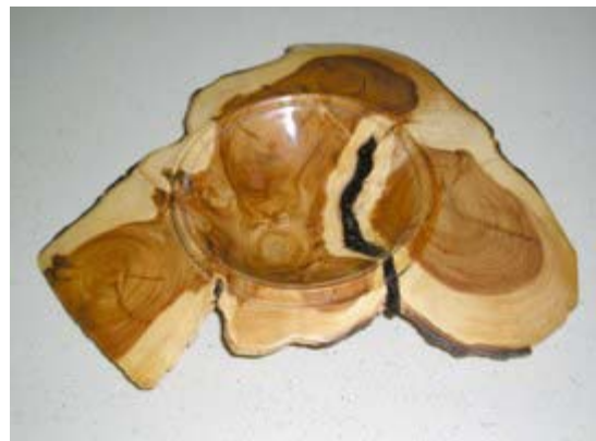
Phil Sargent's Pear wood winged bowl