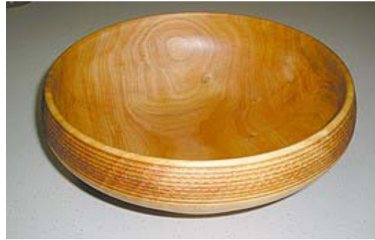
Phil Sargent's Alder utility bowl