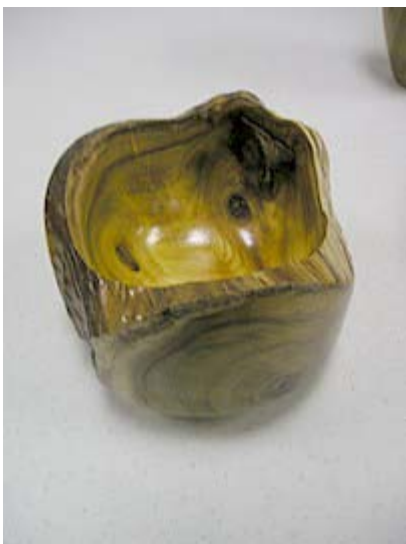
Warren Sabin's "mystery wood" bowl