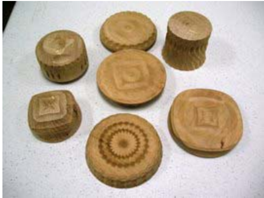
Samples of rose engine lathe work by Russ Swenson