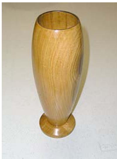
Corwin Jones' Black Locust vessel