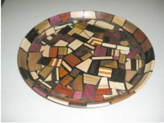
Ron Coney's multiple wood bowl (glued up from scraps.)