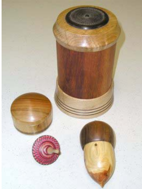
Mets Lerwill's four (yes, four) boxes