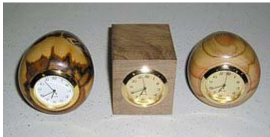
Mets Lerwil's clocks