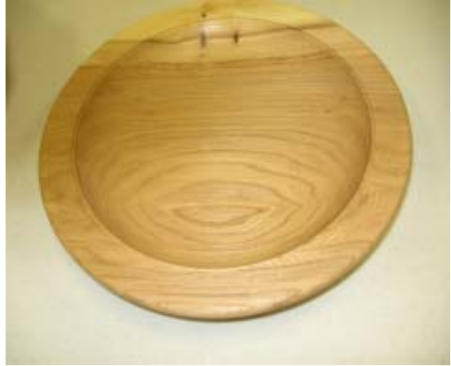
Chuck Renda's Elm platter