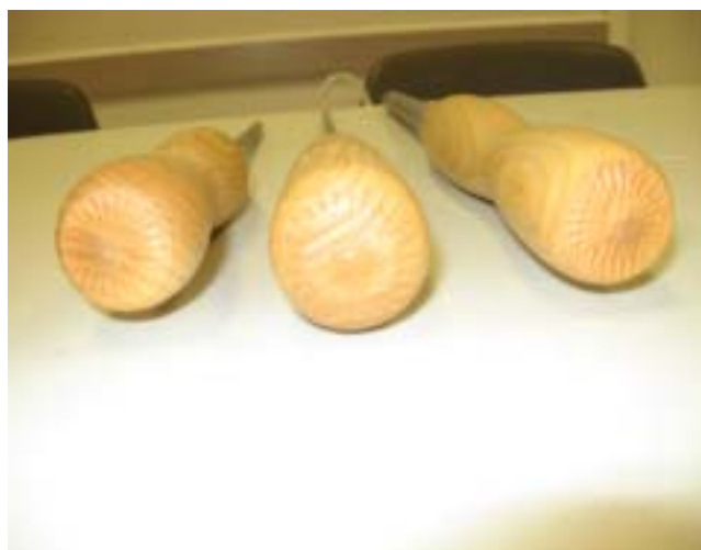
Russ Swenson's rose engine work on handles