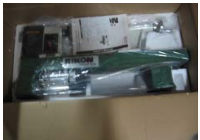
Rikon lathe... in, and (almost) out, of the box