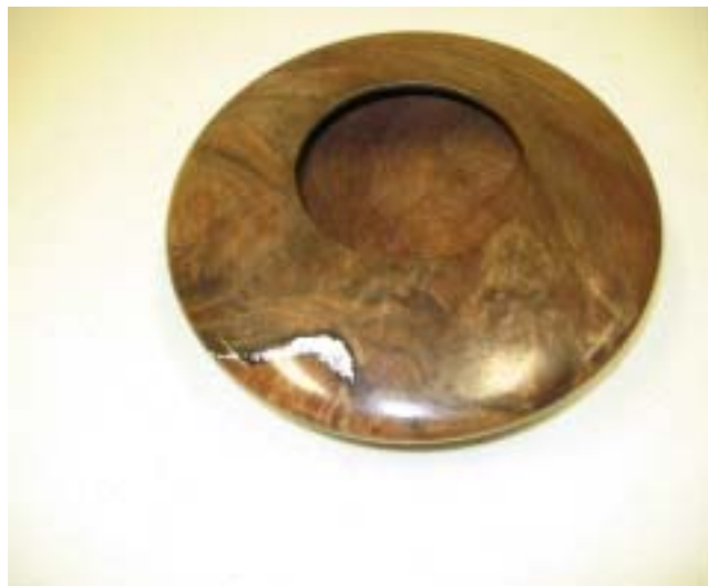
Corwin Jones' Walnut bowl