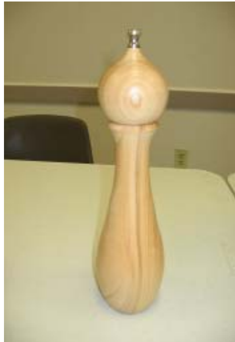
Chuck Renda's Ash pepper mill