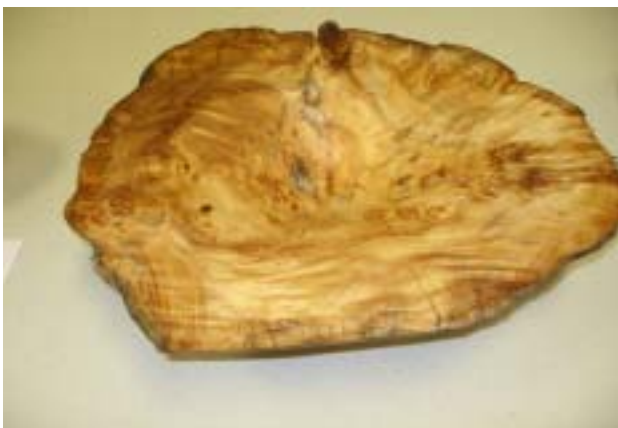
Phil Sargent's Cottonwood burl winged bowl on a pedastal