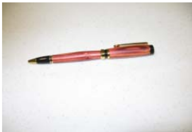
Jim Terrill Canary Wood pen