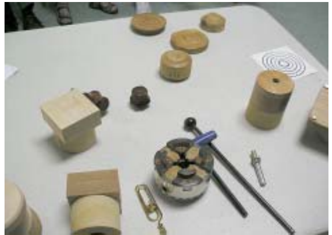
A few of the tools for rose engine work