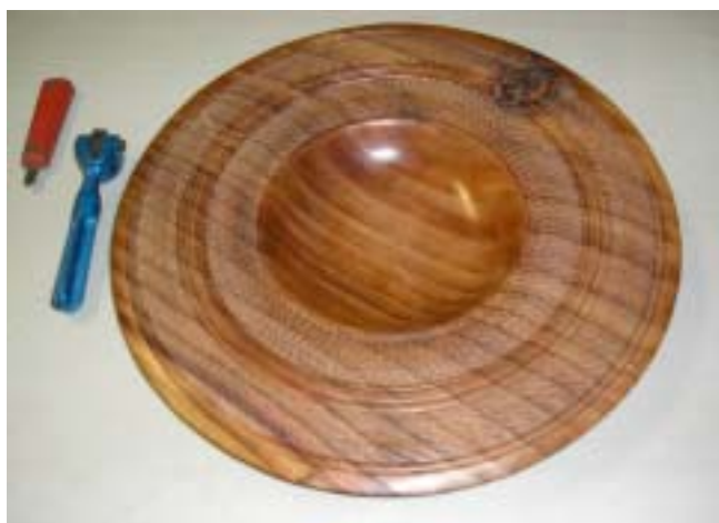
Phil Sargent's Redwood platter and decorating tools.