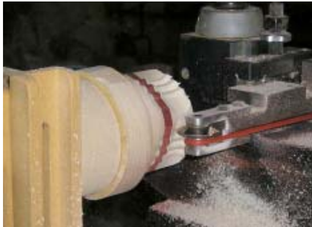
Russ' rose engine lathe up close