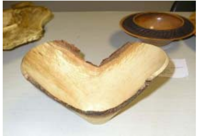
Glenn Robison's Oak natural edged vessel