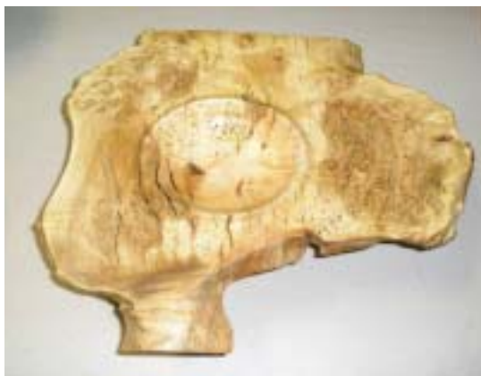
Phil Sargent's Sheoak platter on pedestal.