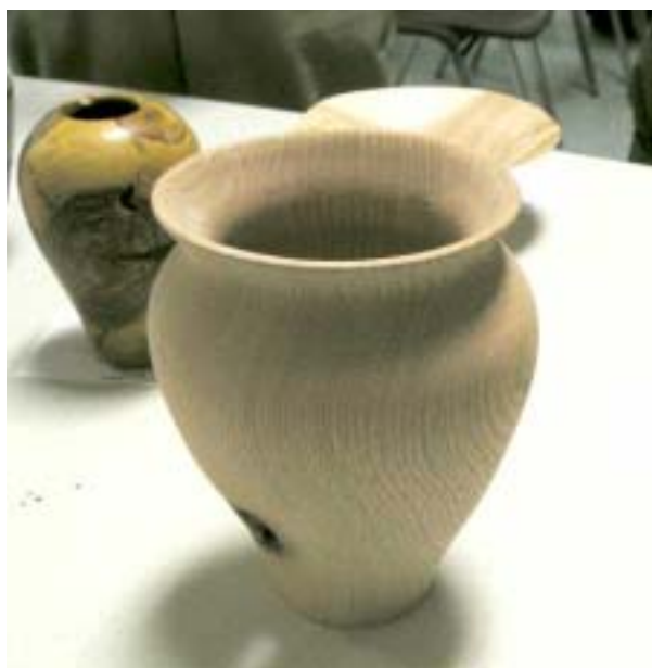
Ted Young's unfinished Oak vase.