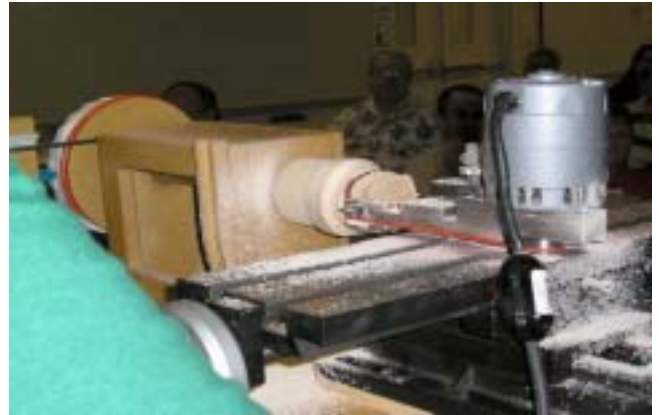
Another view of the rose engine lathe in action