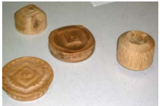
Some of the things one can do with a rose engine lathe.