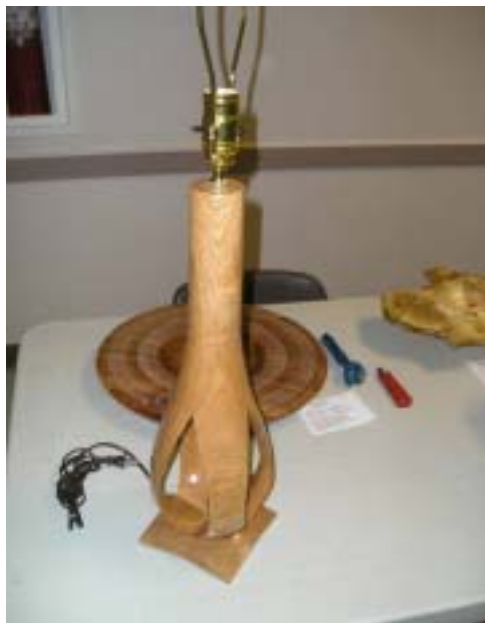
Dan Clark's inside-out lamp.