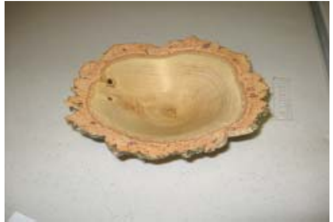
Phil Sargent's Cork Oak bowl