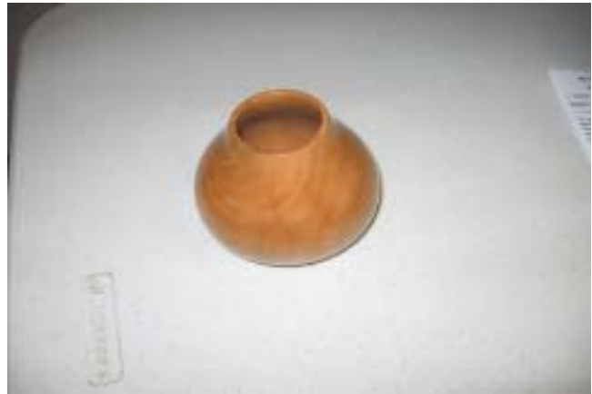
Dale Blue's Ornamental Pear vase.