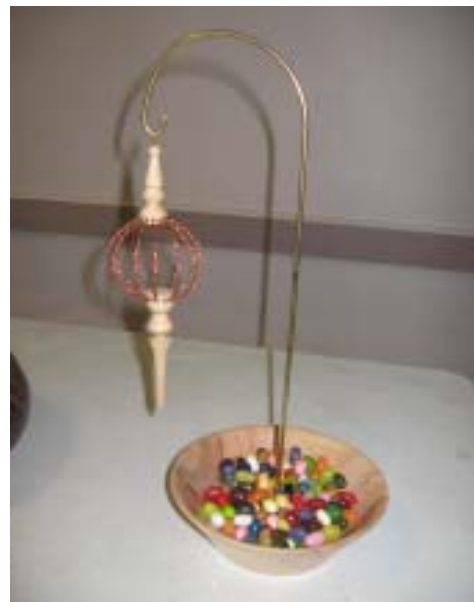
Vincent Cleek's candy dish ornament hanger