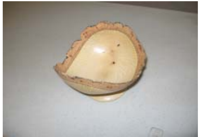
Phil Sargent's Cork Oak bowl