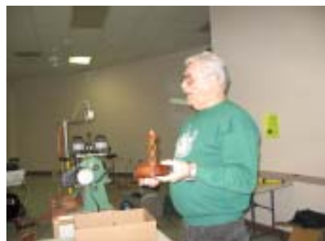
End point of Barley Twist project.