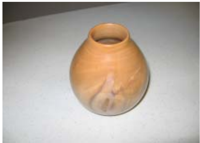
Dale Blue's Ornamental Pear vase.