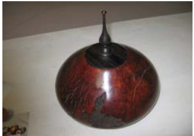
Ted Young's Redwood burl lidded vessel.