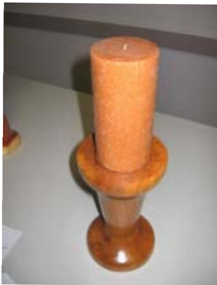
Dan Clark's candle holder.