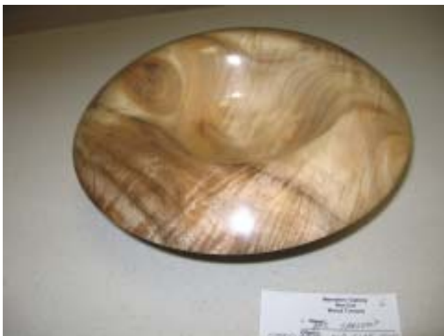
Phil Sargent's Chiquapin chip and dip tray