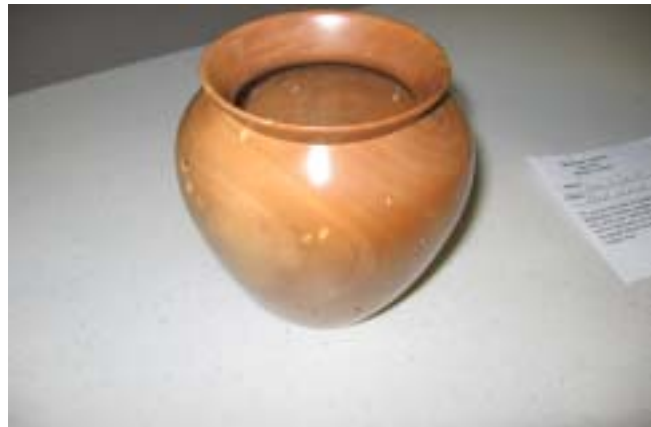
Dale Blue's Ornamental Pear vase.