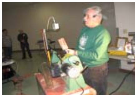
Intermediate point of Barley Twist project.