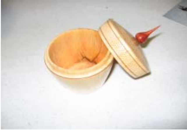
Tom Castaldo's Bristlecone Pine box.