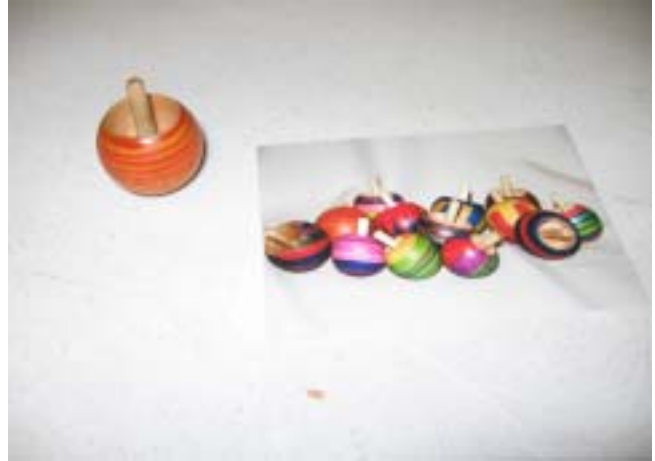
Tom Castaldo's Maple Tippy top(s)