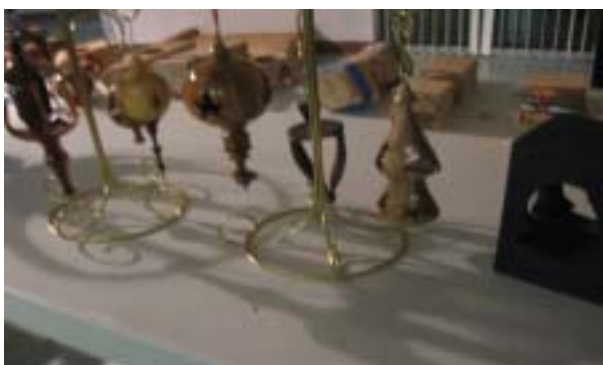
Some finished products.

A “work in progress”. The “inside” has been done and the four pieces reversed to do the outside