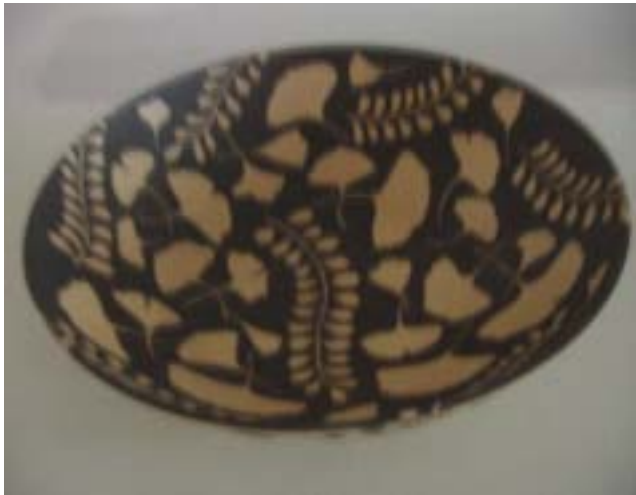
Neal DeVore's Sycamore bowl with pyrography