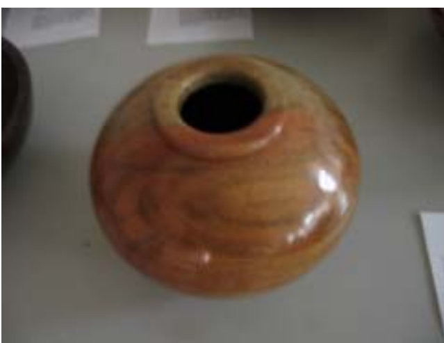
Tom Castaldo's Eucalyptus vessel