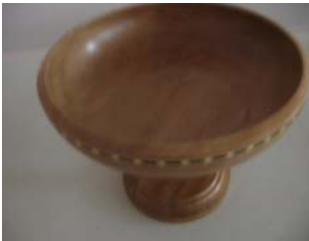
Herb Madsger's Sycamore compote