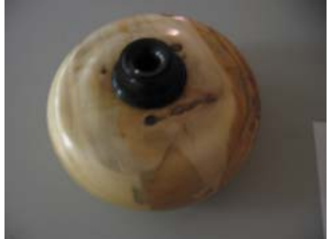
Phil Sargent's Chinquapin closed vessel.