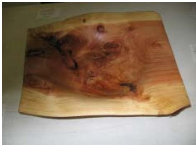
Phil Sargent's Redwood winged bowl