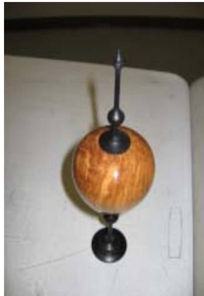
Herb Medsger's Olive hollow vessel with pedestal