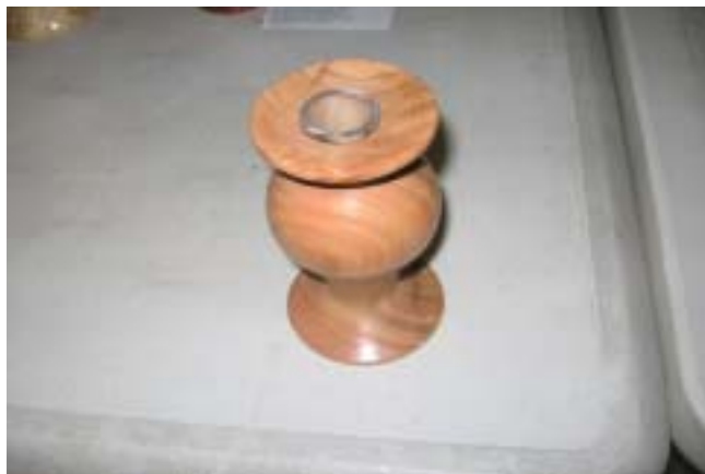
Dan Clark's Eucalyptus vase