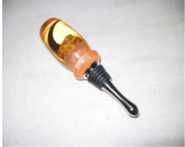
Jo Nelson's polyester resin bottle stopper