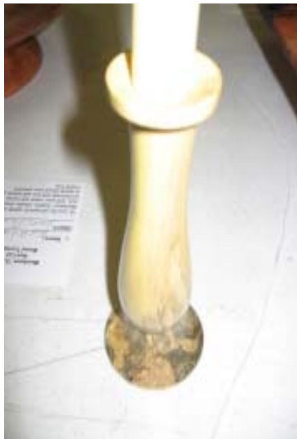
Dick Lambert's candlestick