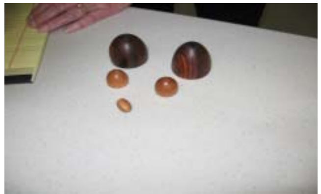
2nd. Place: Peg Sullivan (3 layers)