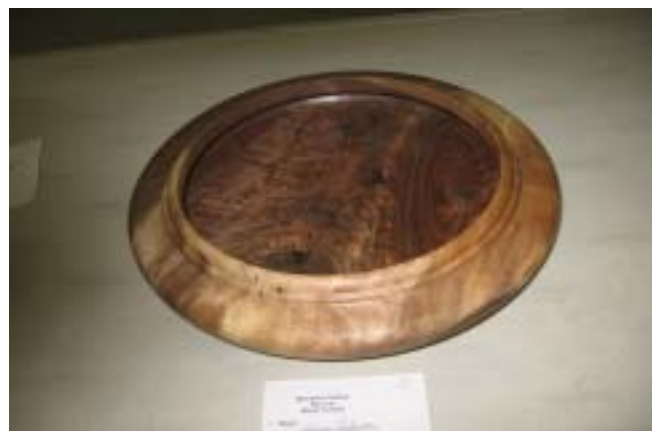
Glenn Robison's Walnut vessel