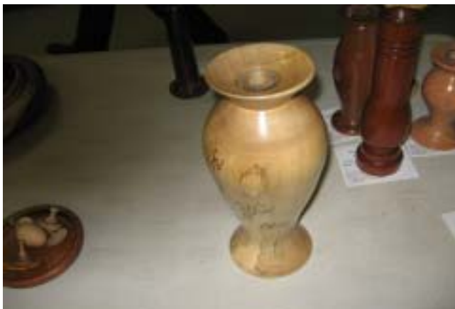
Dan Clark's Maple vase