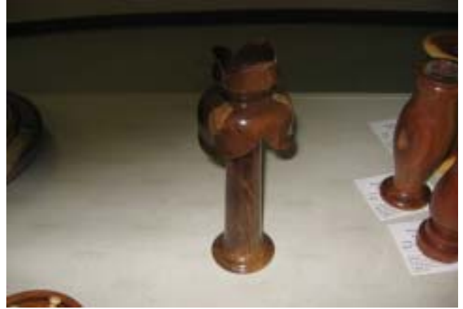
Dan Clark's Walnut vase