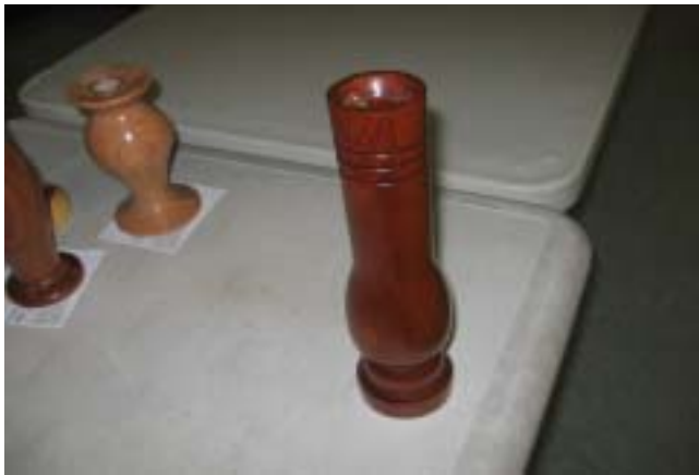
Dan Clark's Mahogany vase