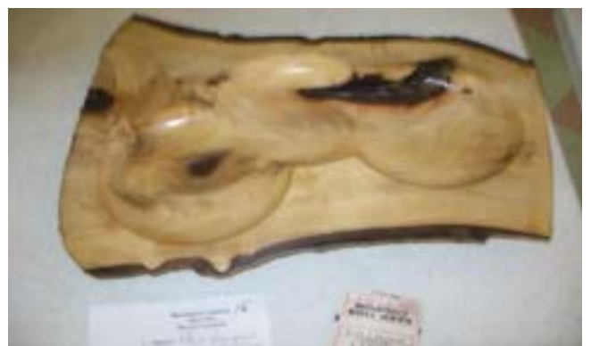
Phil Sargent's English Walnut multiple vessel