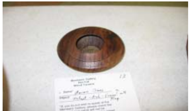
Corwin Jones' Walnut/Ash funnel with plug