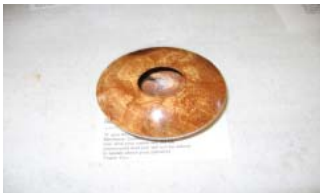
Corwin Jones' Trash Wood "plum"