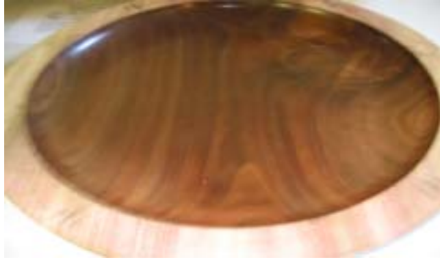
Herb Medsger's bleached Walnut bowl