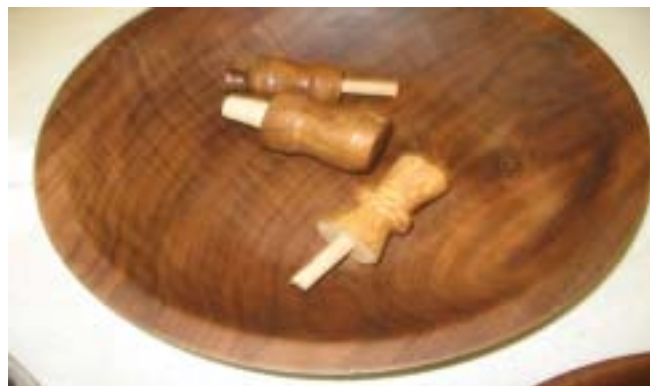
Chris Krohn's Black Walnut bowl w/brass inlay