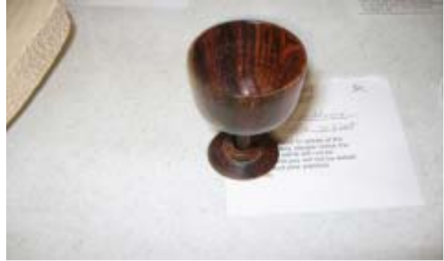
Peg Sullivan's Cocobolo goblet