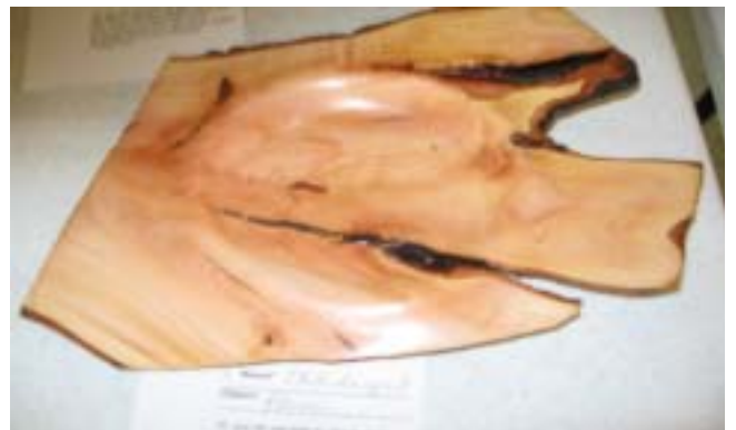
Phil Sargent's Plum vessel