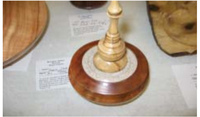
Corwin Jones' African Sumac box