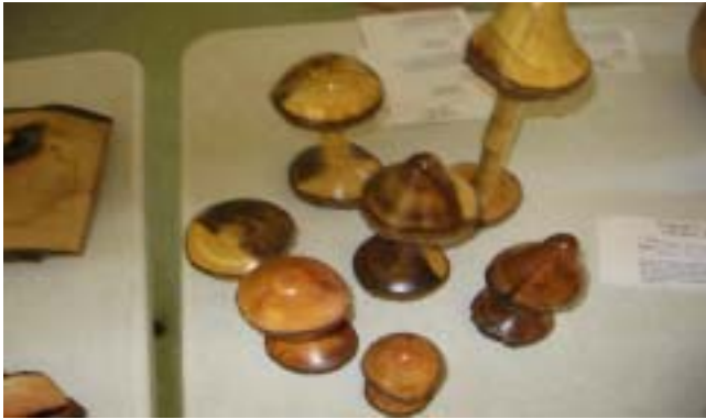
Ted Young's mushrooms