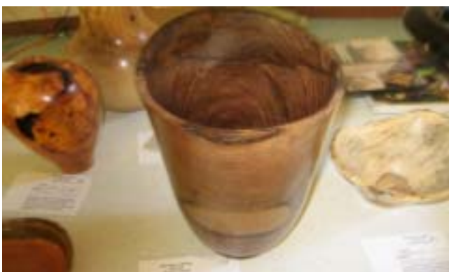
Tom Castaldo's Claro/English Walnut graft vase