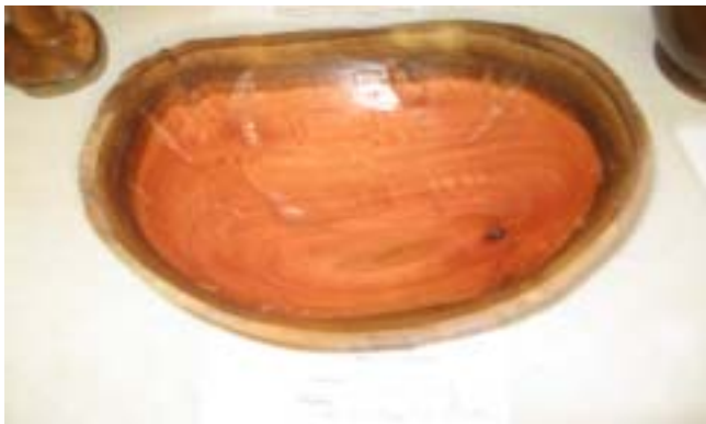
Ted Young's Eucalyptus bowl