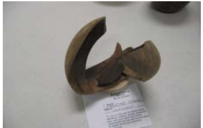
Modern wood art by Phantom Turner