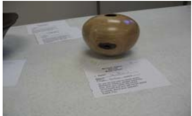
Jay Richins' Maple hollow vessel