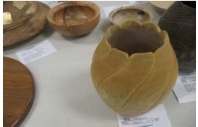
Herb Medsger's carved White Ash vessel