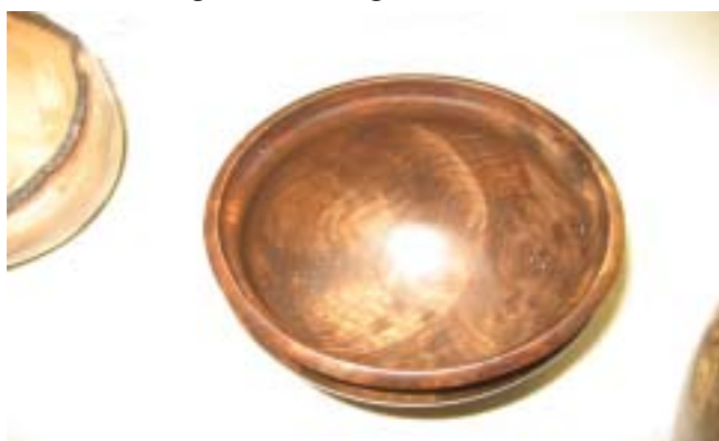
Craig Milliron's Black Walnut bowl