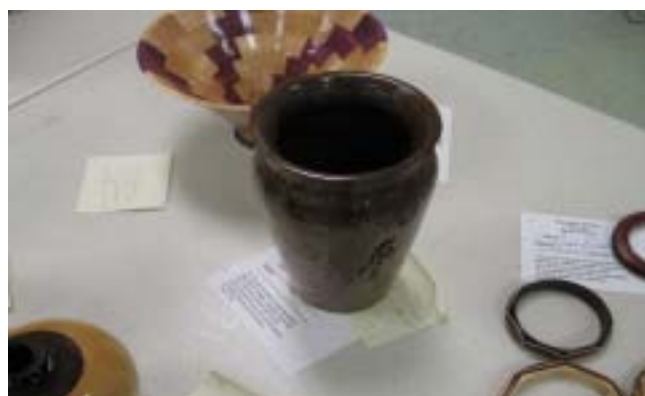
Jose Pantoja's Black Walnut vessel