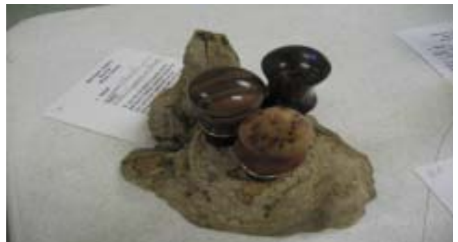
James Terrill's bottle stoppers and base