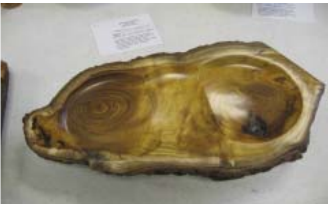
Phil Sargent's 3 axes bowl