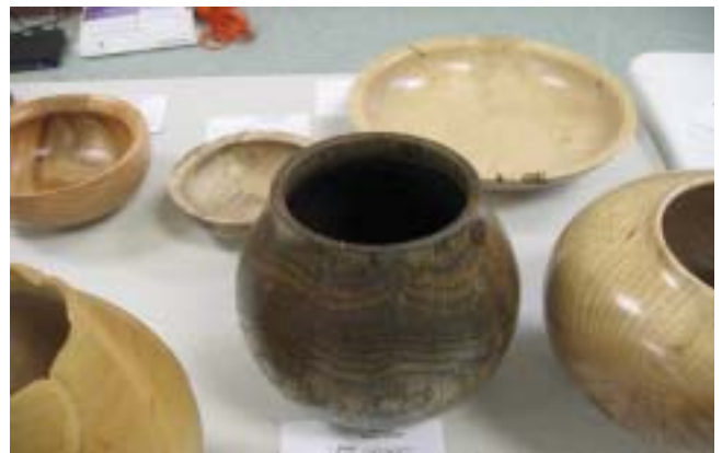
Herb Medsger's dyed Oak vessel