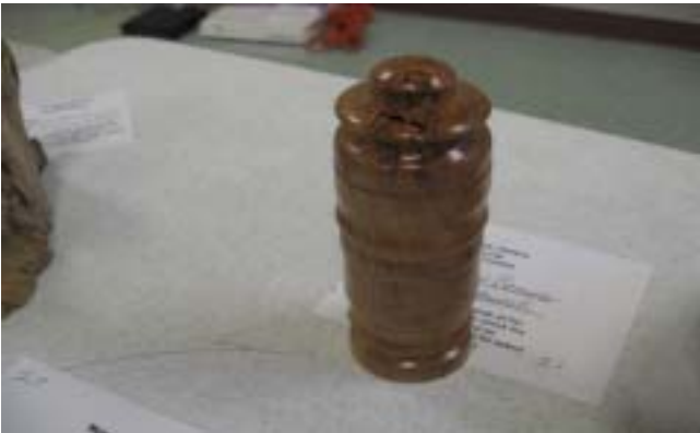
Jerry Brown's toothpick holder