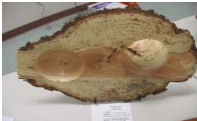
Bill Flewelling's upside down turning