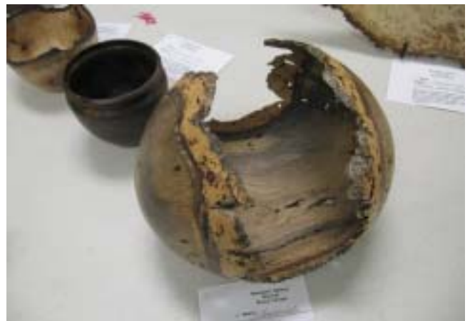
Bill Flewelling's Cork Oak vessel