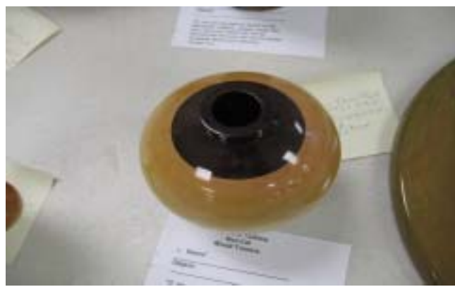
Jose Pantoja's Rhododendron closed vessel