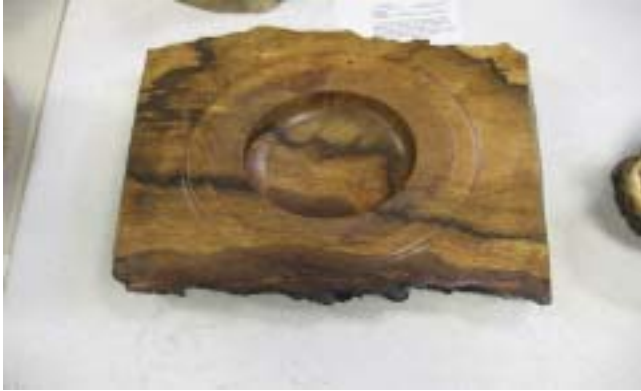
Phil Sargent's Oak winged bowl