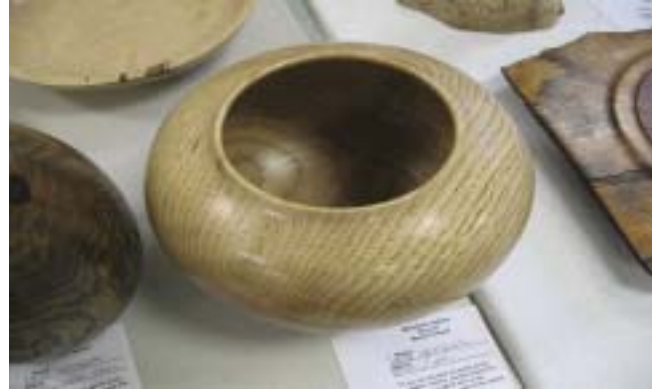
Herb Medsger's Oak vessel