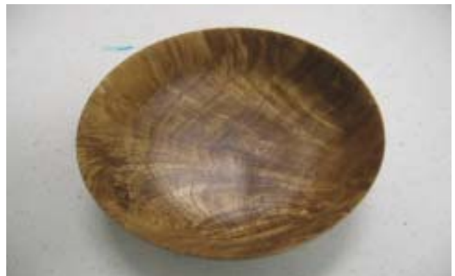
Phil Manning's Walnut crotch bowl