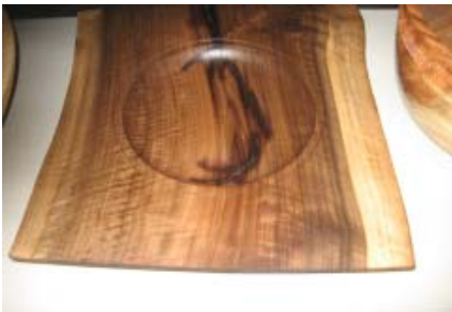
Jay Richens' Walnut platter