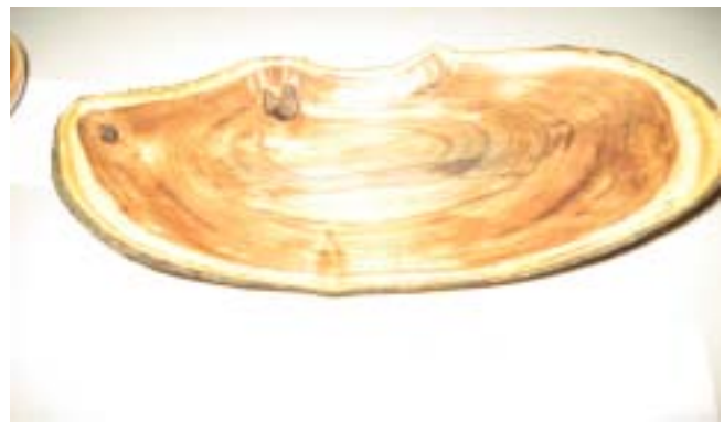
Dan Clark's Silk Tree bowl