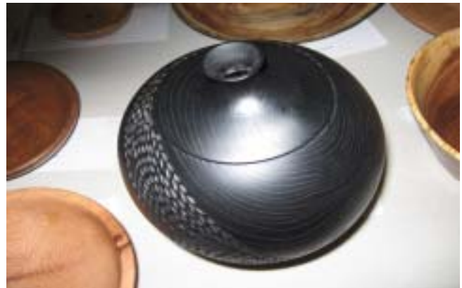
Herb Medsger's Hackberry hollow vessel