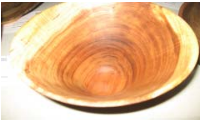
Dan Clark's Eucalyptus bowl