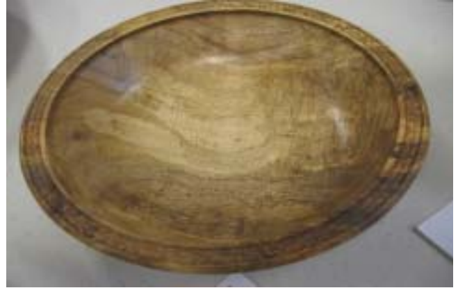
Phil Sargent's She-oak platter