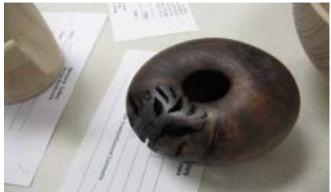
Ted Young's Walnut spirit vessel