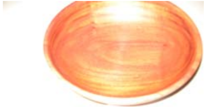
(Unidentified turner and material)