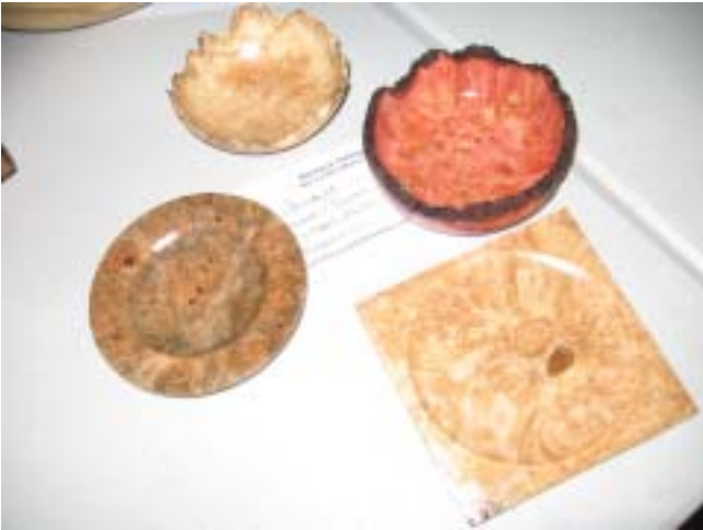
Tom Castaldo's "Four small pieces"