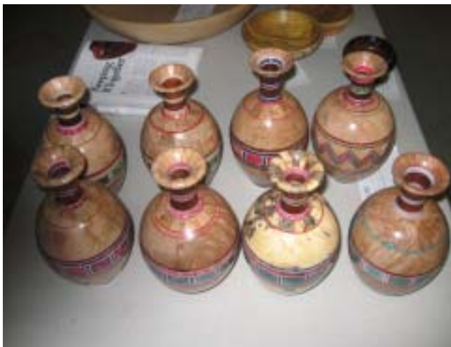
Henry Meier's eight segmented vessels. Maple burl, Birds-eye Maple and Buckeye with pen blank deco rings