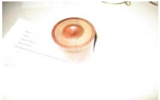
Brian Michaud's Red River Oak box