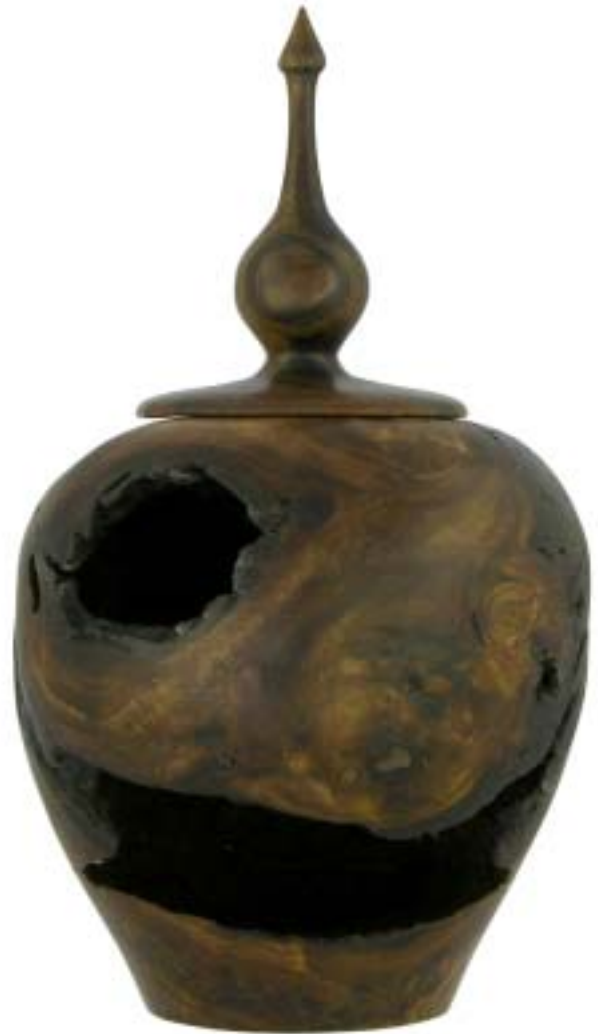
Ted Young's Walnut lidded vessel