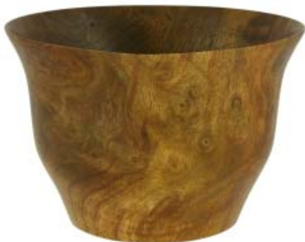
Dale Chabino's Walnut crotch bowl