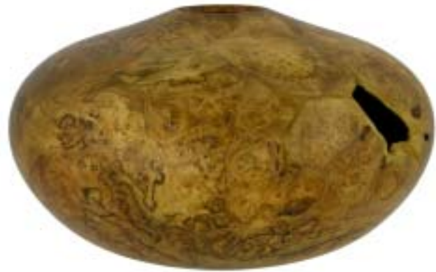
Jay Richins' spalted Maple burl vase