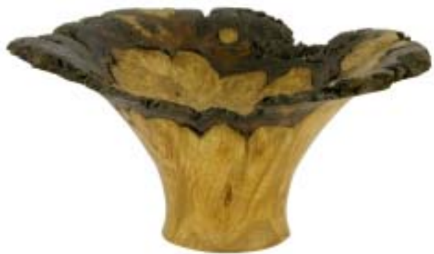
Tom Castaldo's natural edged Maple burl bowl