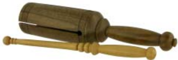
Tom Castaldo's Walnut and Cherry percussion piece