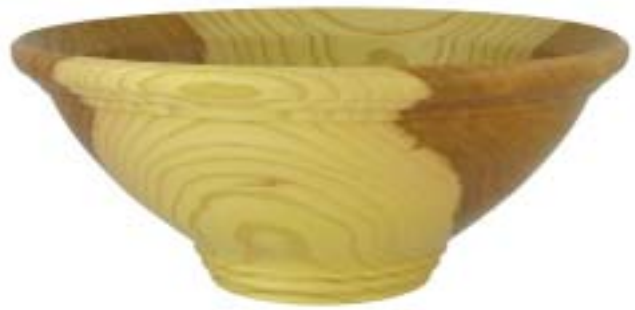
Phil Sargent's Chinese Elm salad bowl