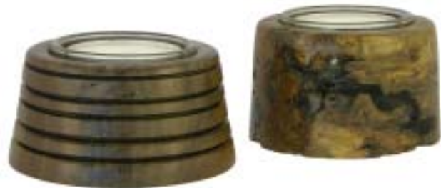
James Terrill's tea lights: One of Walnut and one of (unknown) wood