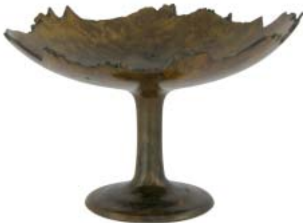
Phil Sargent's long stemmed natural edged bowl of Walnut burl