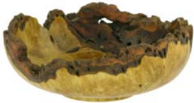
Tom Castaldo;s natural edged Maple burl bowl