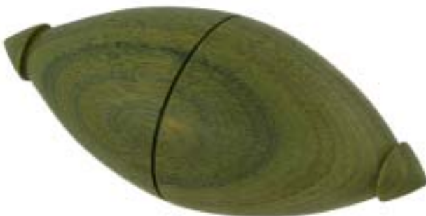
Jay Richins' Lignum Vitae lidded box