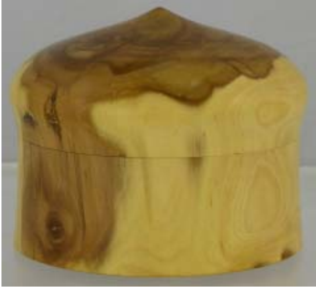
Tony White's small box of Apple wood