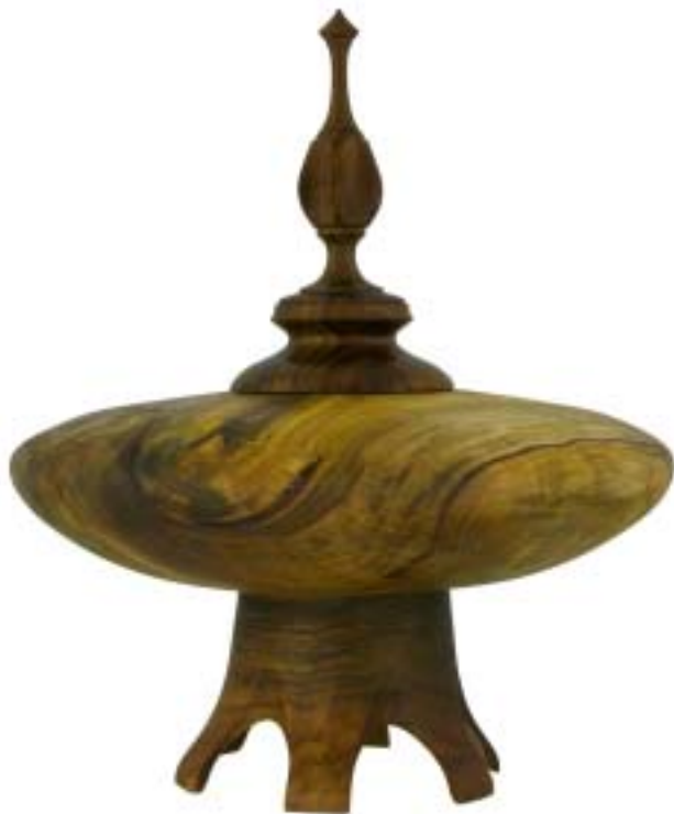
Corwin Jones' lidded hollow vessel with turned and carved finial and stand