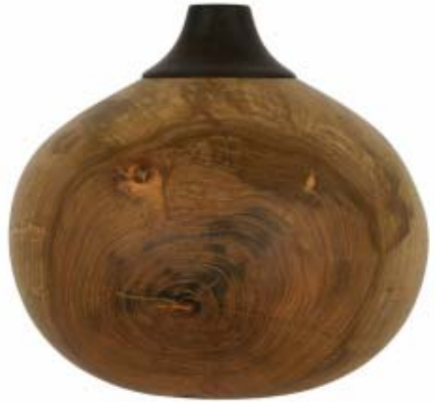
Dale Blue's Apricot closed vessel