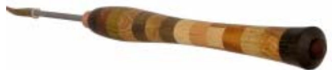
Tool handle by unidentified turner.