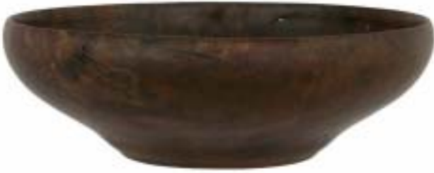
Craig Milliron's Black Walnut bowl