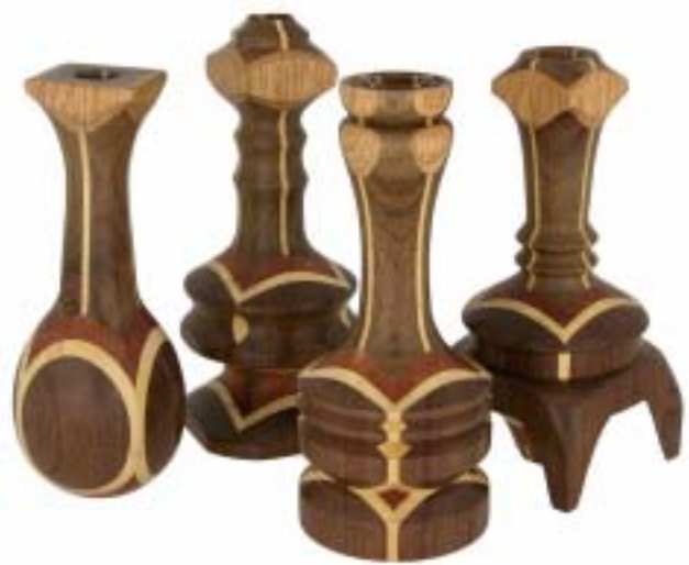
Corwin Jones' segmented bud vases of Walnut, Oak, Privet, Red Cedar and Maple