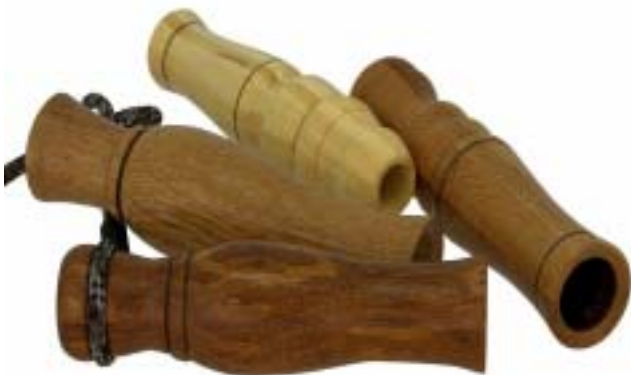
Floyd Norling's Bamboo duck calls