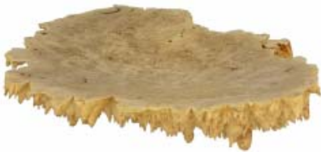
Phil Sargent's Mable burl platter (chuck-free burl turning)