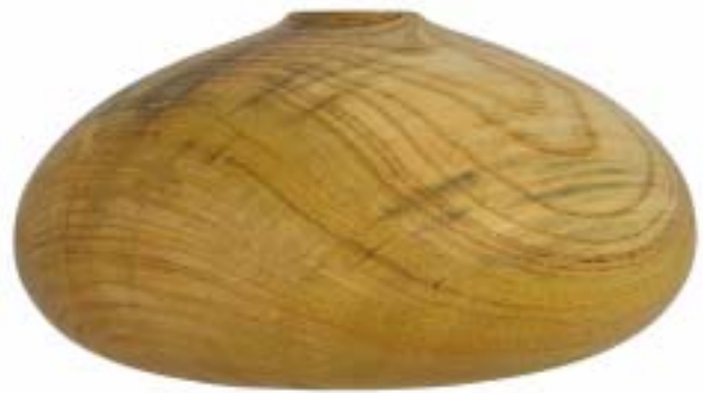
Ted Young's spalted Maple hollow vessel