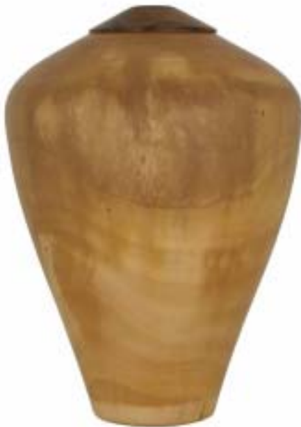
Dale Blue's Ornamental Pear vessel with walnut collar