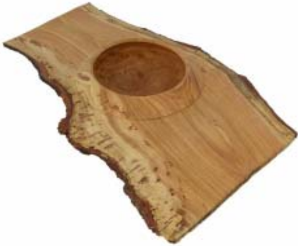
Dwight Rutherford's natural edged vessel of Honey Locust and Mistletoe (collaboration with Bill Flewelling)