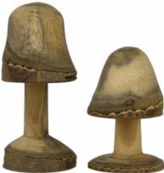
James Terrell's Oak mushrooms