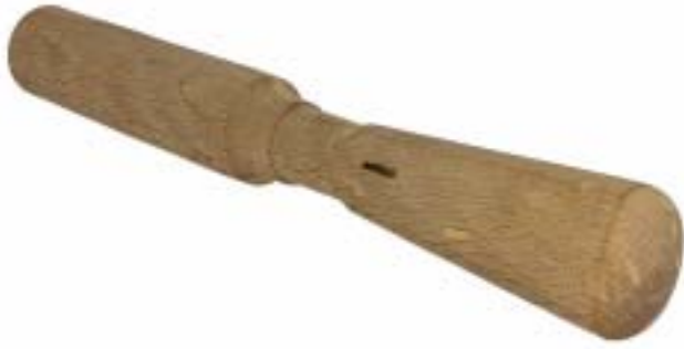
Phil Manning's Oak multi-center turning